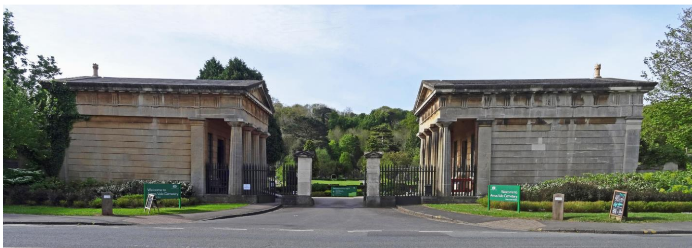
Arnos Vale Cemetery - Main Entrance on Bath Road