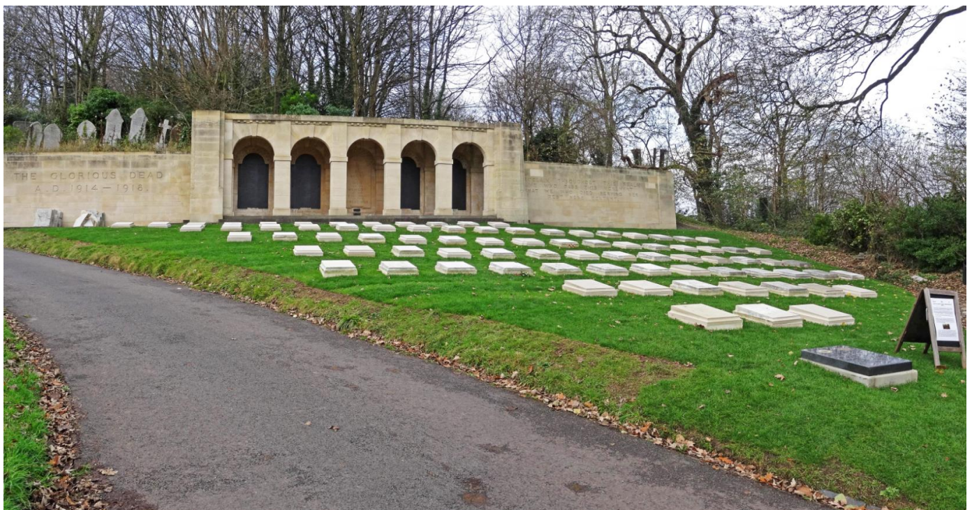
New Memorial Stones