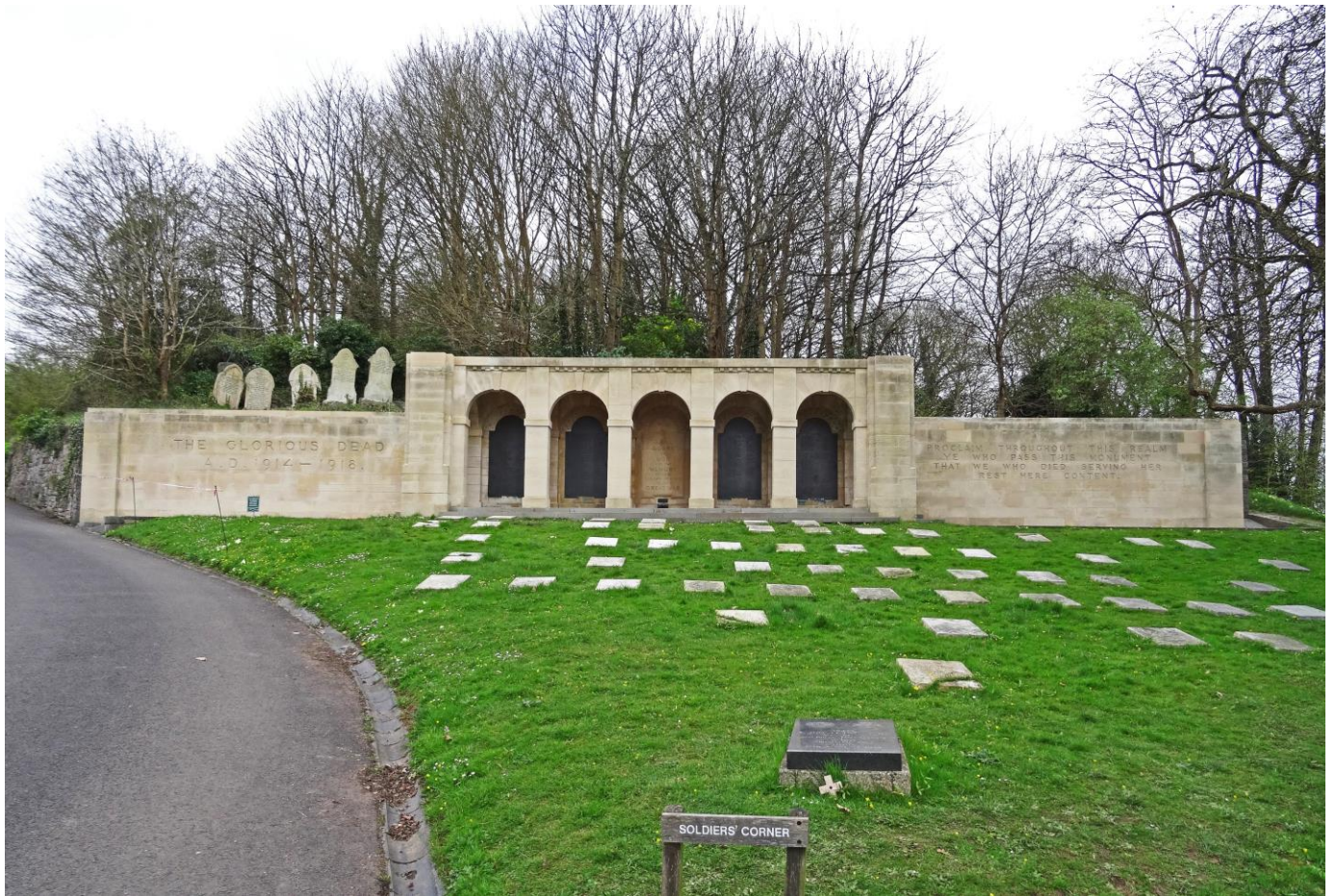
Soldiers' Corner – Arnos Vale Cemetery